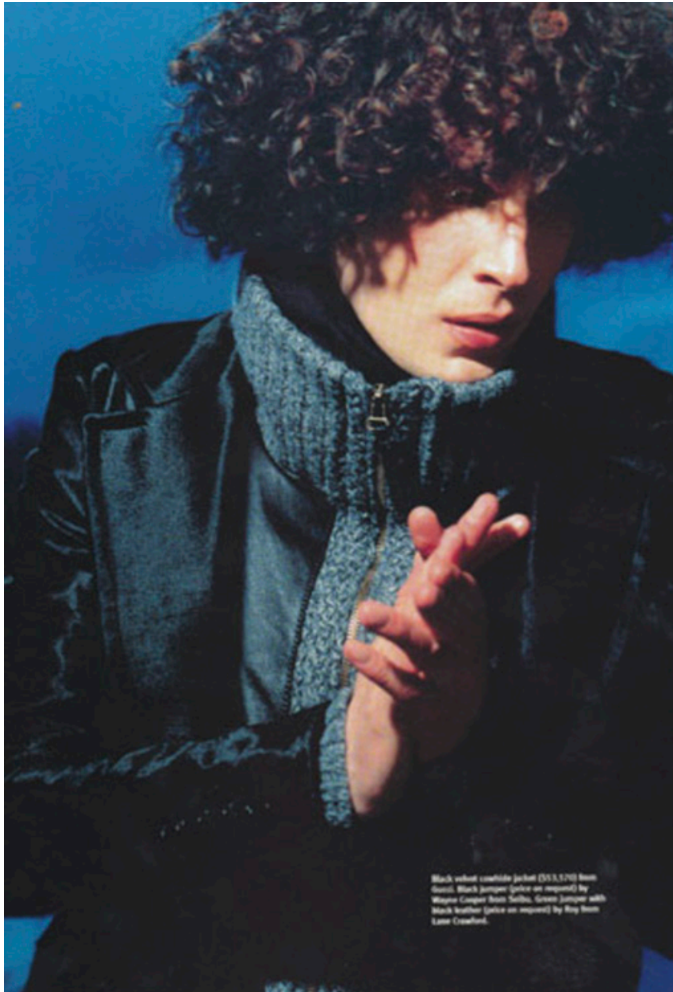
Black velvet corduroy jacket ($533,170) from Giant. Black jumper (price on request) by Wayne Cooper from Sello. Green jumper with black leather (price on request) by Ray from Lane Crawford.

HGHT 191 / 6'3 CHST 86 / 34 WST 76 / 30 SUIT 40L CLLR 38 / 15 SHOE 11 / 44 HAIR BRWN EYE BLUE